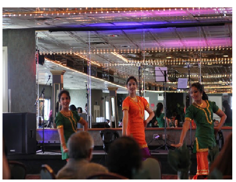
Mai Family services is a 501(c)(3) non-profit organization

Mai Family Services hosted an afternoon on the Detroit river with fun, food and entertainment. We raised 10K.